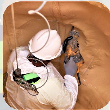
The sewer lines are reopened and ready for immediate use.