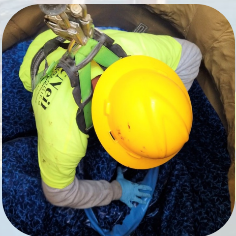
Inflation Bladder is being stripped from the cured liner.