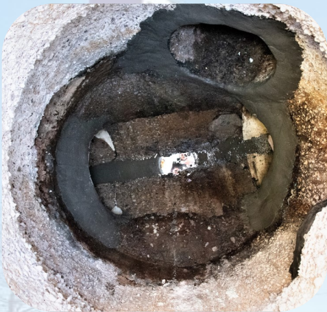
Structure is pressure cleaned; pipes are trimmed & grouted.