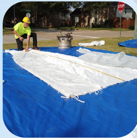
Liner is inspected at the jobsite to verify correct fit.