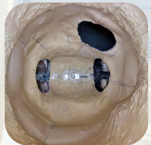
“After” shows the big difference a Triplex Liner makes!

“Do it once and you’re through—and that’s mighty good!”