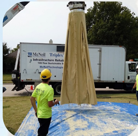
Epoxy saturated liner is ready to be lowered into place.