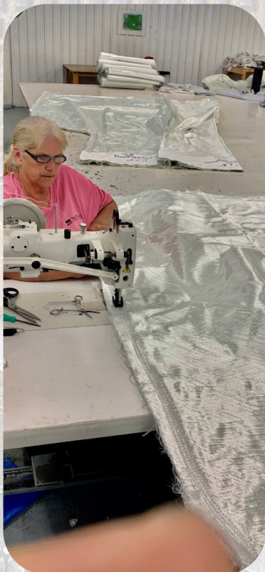
Above: McNeil Technologies Inc. manufacturing facility in Bonifay, Florida. Below: Liner and Bladder custom fabrication.