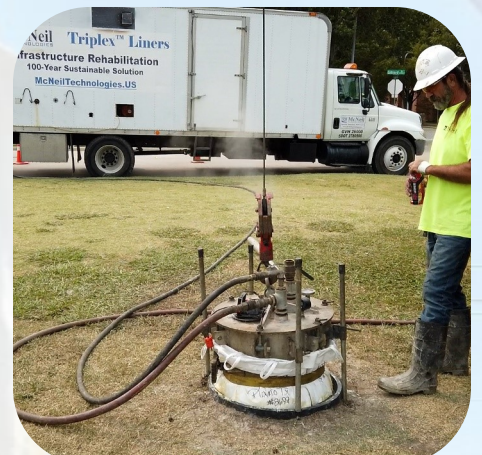
The liner is in place, under pressure and steam curing.