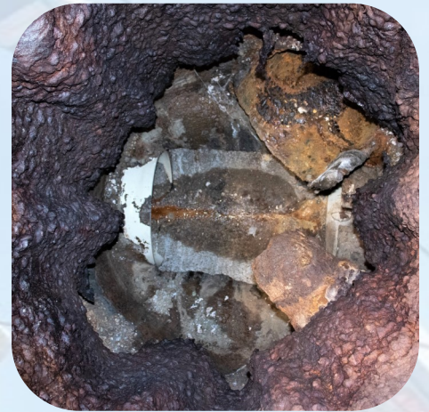
Manhole to be lined has failed rehab materials.