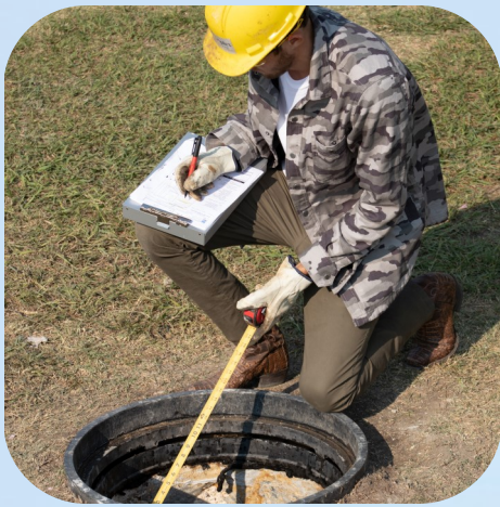
We measure each structure for a custom liner.